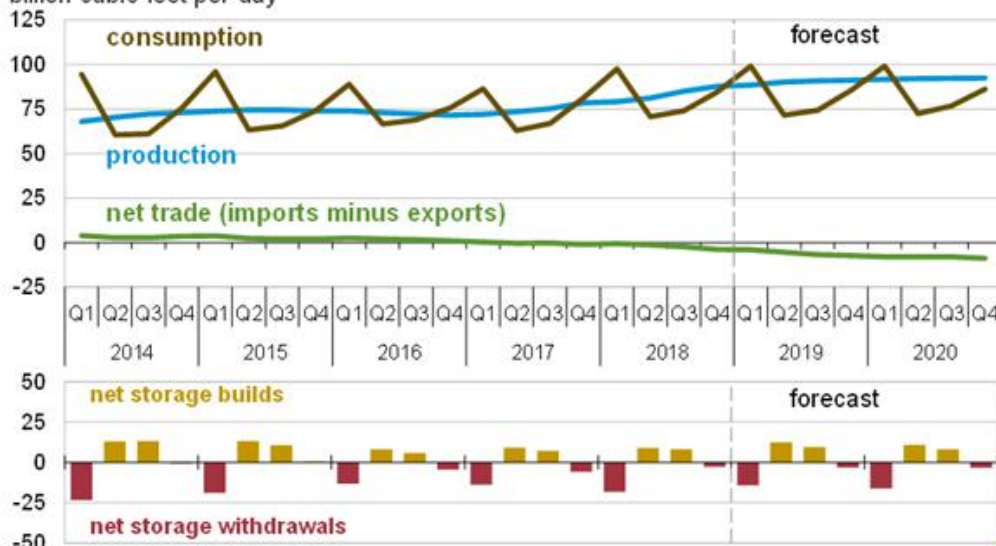
Source: Short-Term Energy Outlook, February 2019